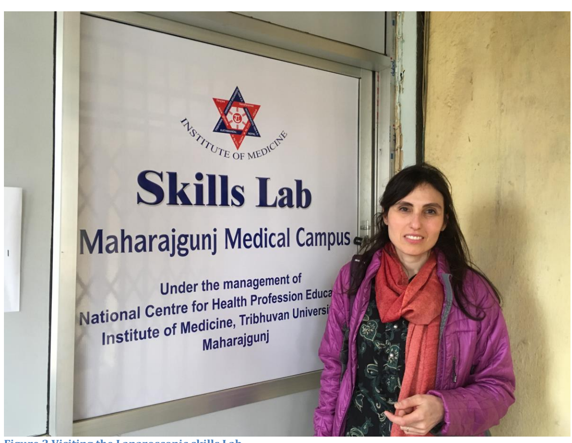
Figure 2 Visiting the Laparoscopic skills Lab