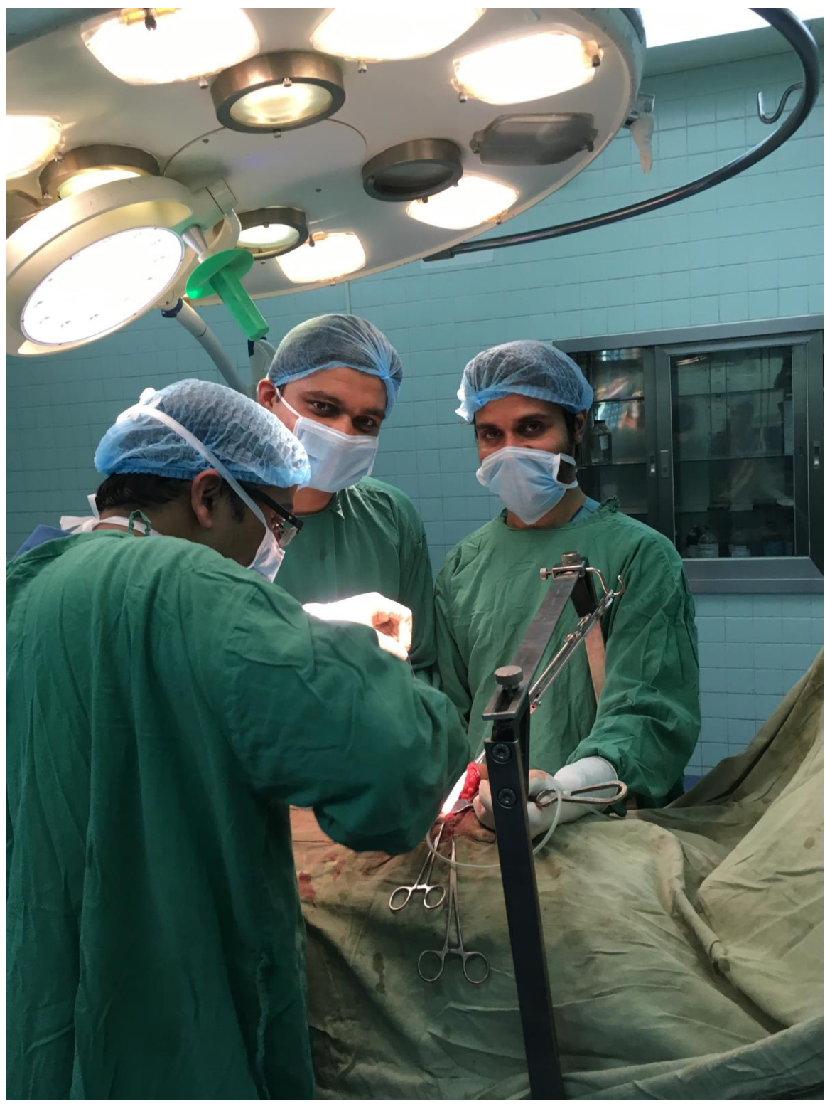
Figure 3 common bile duct exploration